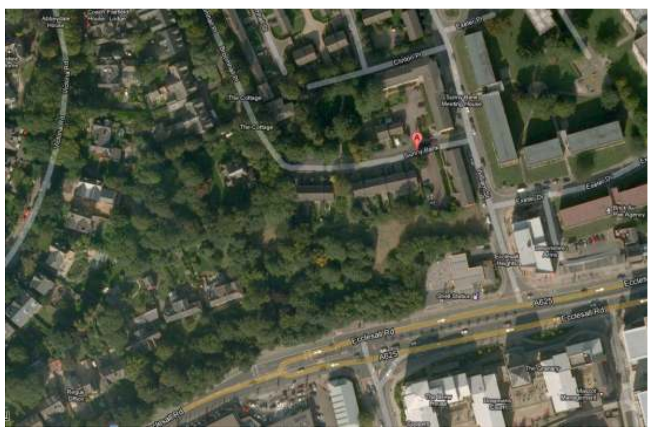
Aerial photo of Sunnybank NR

The fact that catches were restricted to the northwest – west – south edge of the site is not surprising when one looks at the aerial photograph of the site; the flats and residential area towards the north and east are relatively devoid of cover, with open mown spaces and few trees. In contrast, the private housing to the northwest and west has relatively large garden areas and mature trees, providing much more of a continuous, covered habitat that is suitable for wood mice.