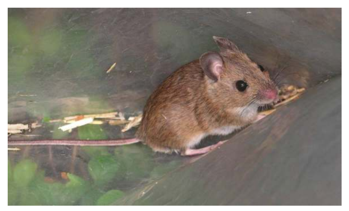
Wood mouse

The only species captured were wood mice. The wet and windy conditions meant that fewer photographs were taken than normal, however these photographs are illustrative of the wood mice caught during the survey.