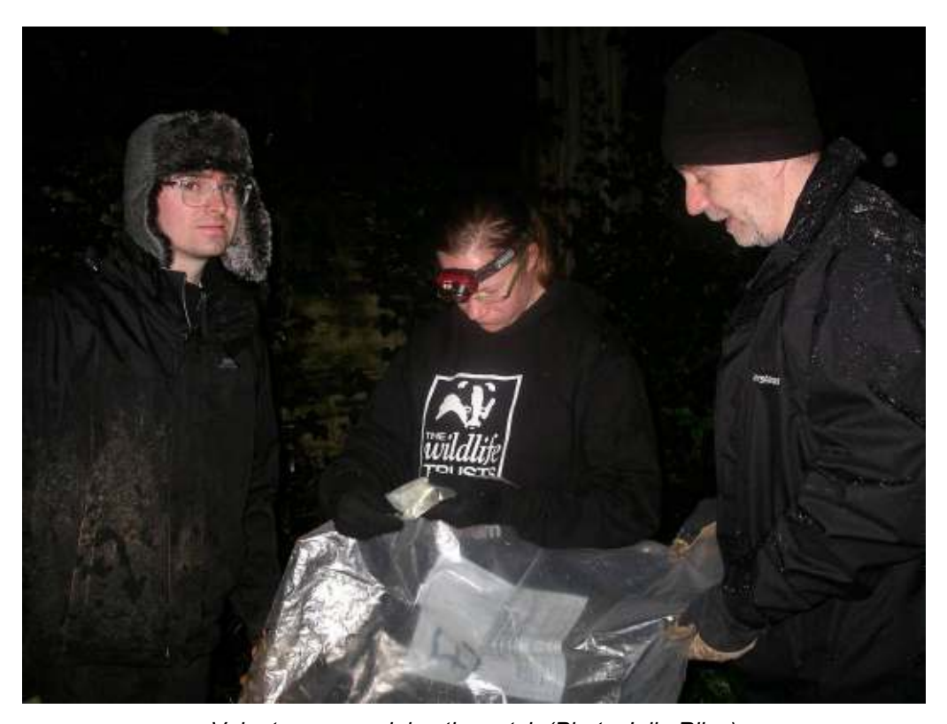
Volunteers examining the catch