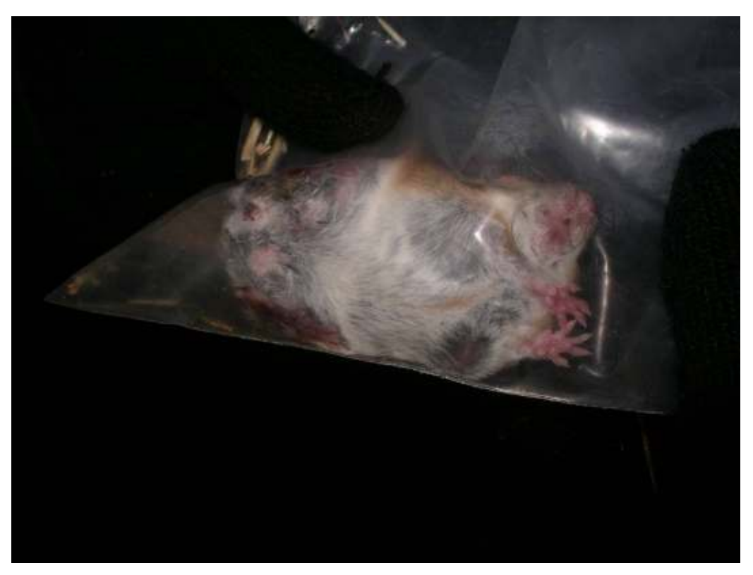
Sexing a wood mouse in a plastic bag