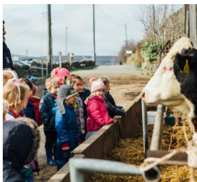
Landscape Connections, outdoor learning opportunities.