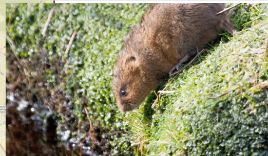
Water vole are threatened with extinction in Sheffield. We will work to protect them.

More people active & engaged in the future of the Sheffield Lakeland landscape.