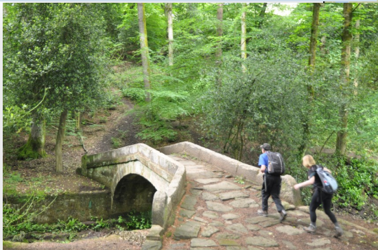
Above: A pack horse bridge at Glen Howe Park tells us about the building of the reservoirs as well as the area's trading past.

A celebration of our rich cultural heritage, stories and memories.