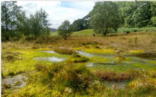
Above: Agden bog above Bradfield— home to rare plants & wildlife & also important for natural flood management.

A more natural, connected & resilient landscape and a better understanding of eco-system services .