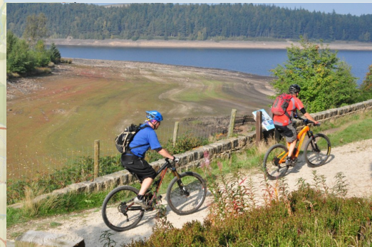
Working with our partners to balance the needs of wildlife, recreation and productive land management at our most popular locations.

A shared understanding of what makes the area special for people & wildlife.