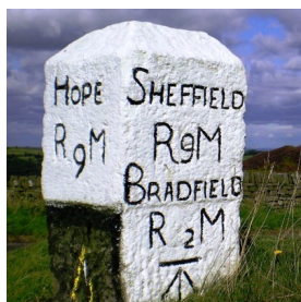
Historic Milestone