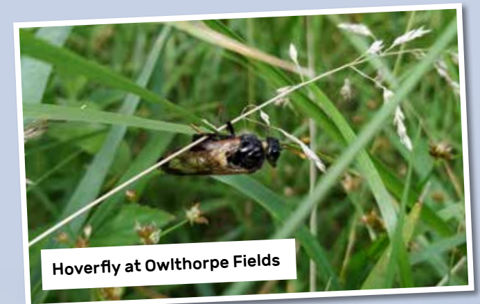
Hoverfly at Owlthorpe Fields

The fields are a great example of a site that could be allocated as Wildbelt – a proposed new land designation that The Wildlife Trusts are calling for, specifically to allow nature to recover and to protect it during recovery. If places like Owlthorpe Fields could be designated as Wildbelt, they would have some protection from development and contribute to 30% of land great for nature by 2030.