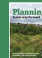
Cover picture: Owlthorpe Fields in Sheffield - see page 15 for more information

It's the only way to rebuild public trust in planning