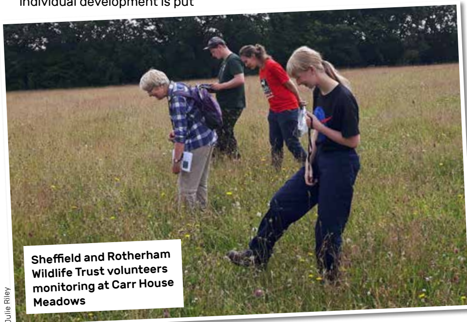
Sheffield and Rotherham Wildlife Trust volunteers monitoring at Carr House Meadows

"Without accurate knowledge of the habitats and species on site, schemes such as Biodiversity Net Gain will not work."