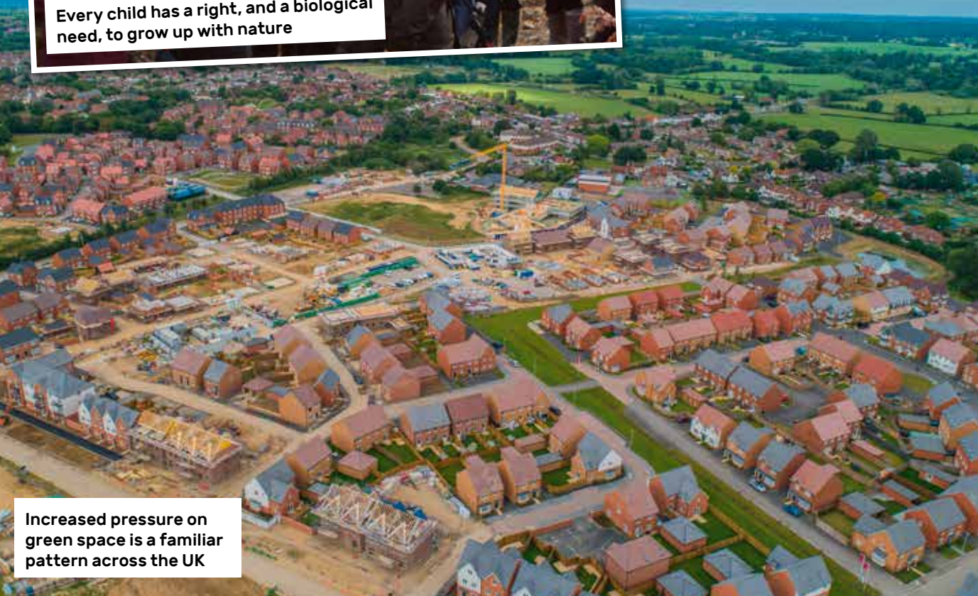
Increased pressure on green space is a familiar pattern across the UK

The right for people to comment on proposals goes back 70 years