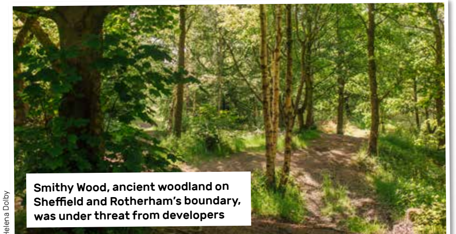
Smithy Wood, ancient woodland on Sheffield and Rotherham's boundary, was under threat from developers

in which people engage in the planning system. For most development, there would be only one point at which people can have a say: during the preparation of the local plan.