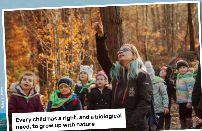
Every child has a right, and a biological need, to grow up with nature

To create places where people can live and enjoy healthier lives, we need nature to be integrated into urban areas through innovative design and placemaking. This must ensure that there are enough green spaces for people to have proper access to nature.